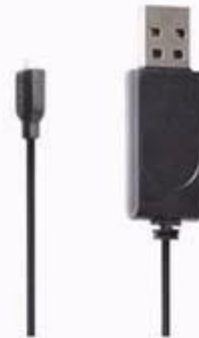
universal USB charging line x1