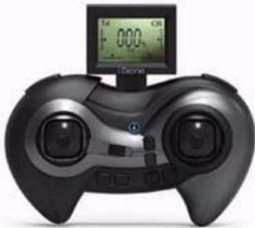
with LCD transmitter x1