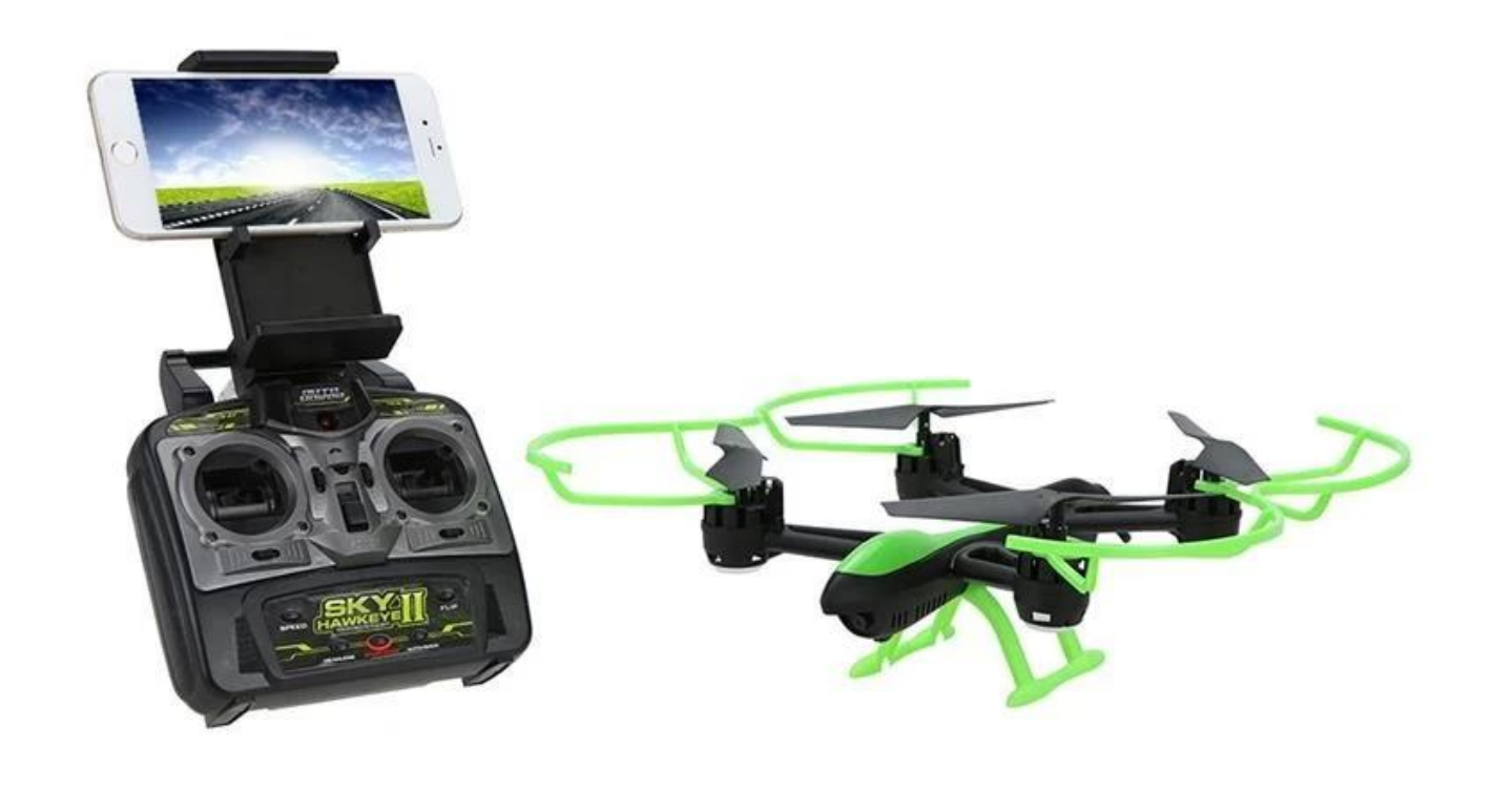
P.S. The phone is not in package.