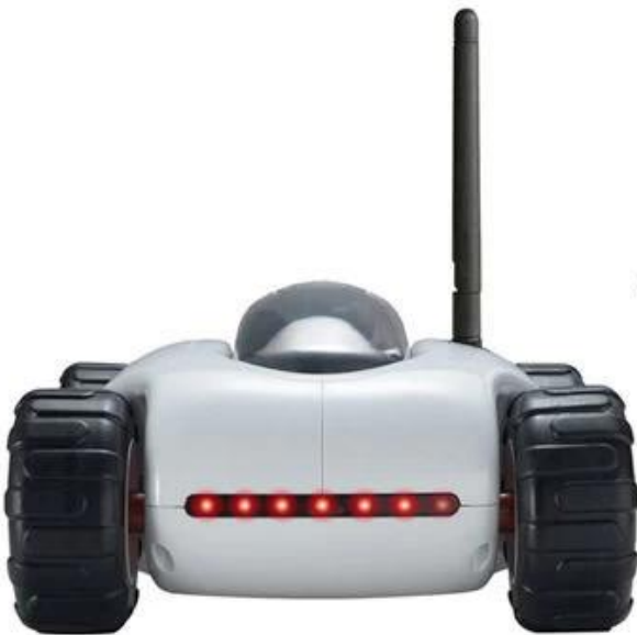
Charging And Running Led Indicator