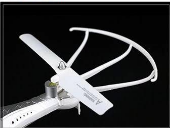
6 PROTECTION COVER