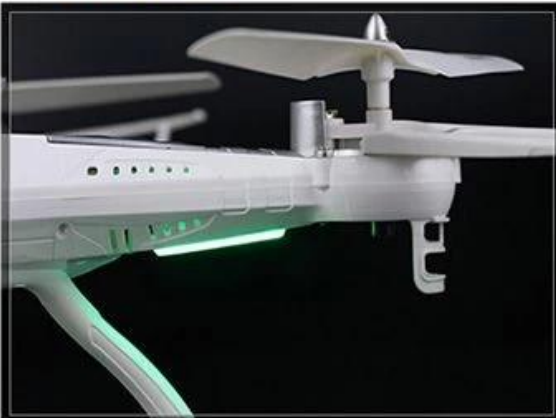
4 FLASH LIGHT