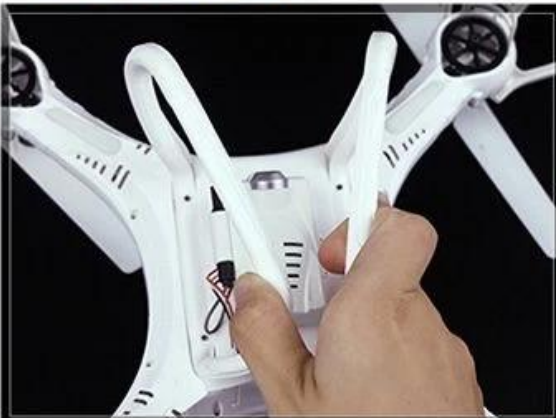
8 FLEXIBLE LANDING GEAR