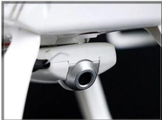
7 HD CAMERA