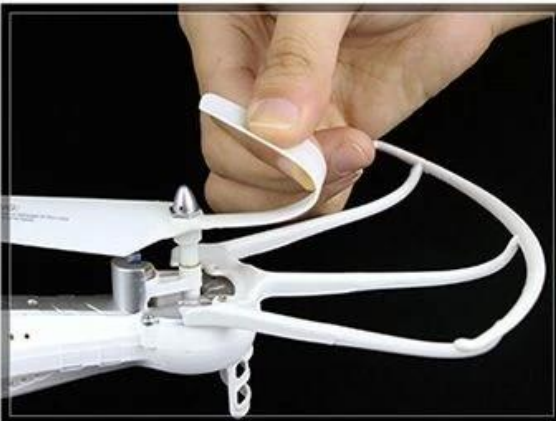
2 TOUGH BLADE