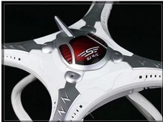
1 UNIQUE APPEARANCE DESIGN