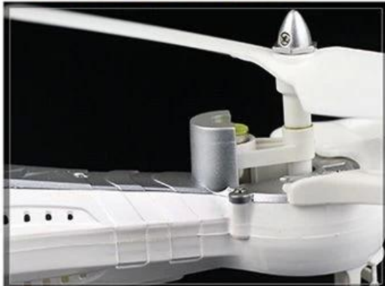
3 SEPARATE MOTOR